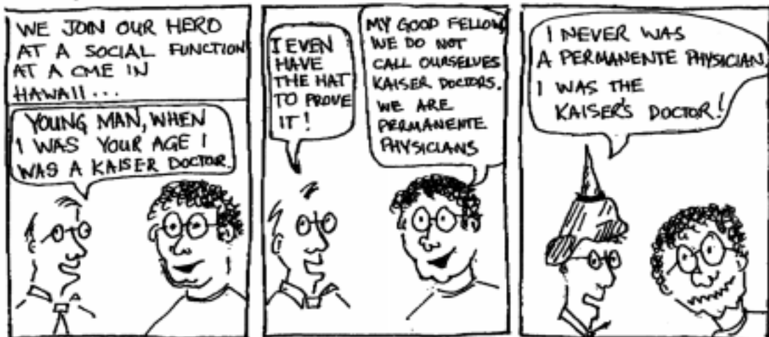
VERDUN BY JOE OLENIACZ